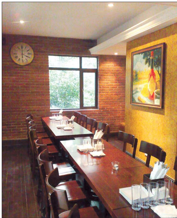
The Boxing Cat Brewery (above) is a gastro pub with homemade beer and Southern US comfort food, while Southern Belle (top and left) is an elegant bar offering small eats and Southern cocktails.

Englishman Alan Fulton, who is now at Bulldog Shanghai, the cleverly constructed concoctions ought to be instant crowd pleasers — even macho men can enjoy these colored drinks.